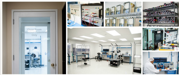
"State of the Art" repair facility